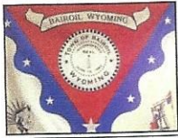
Sue Rigano Mayor

Town of Bairoil 1101 Antelope Drive PO Box 58 Bairoil, WY 82322 307-324-7653 www.TownOfBairoil.com