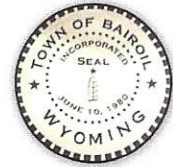
Kim Tompkins Relief Clerk

Town of Bairoil 1101 Antelope Drive PO Box 58 Bairoil, WY 82322 307-324-7653 www.TownOfBairoil.com